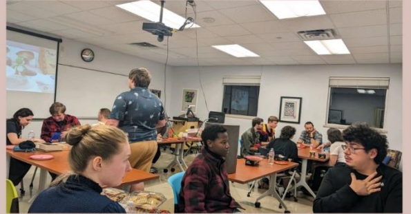
Honors Game Night (Last Week of Classes)