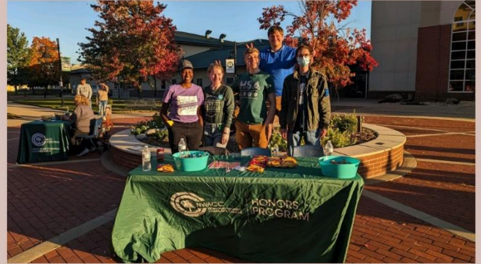
Tabling for honors at Fall Fest