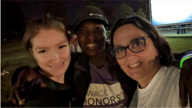
Hanging out for Halloween Movie Night Post-Fall Fest