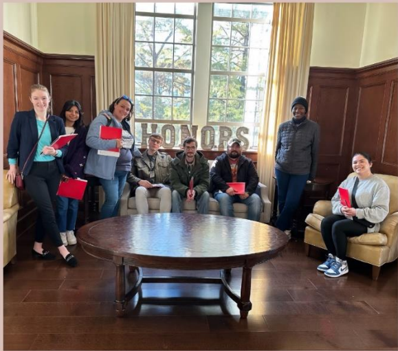
Visit to University of Arkansas, Fayetteville Honors Program

As for soft skills, honors engagement taught me how to network and communicate, as events like the Tour of UARK Fayetteville Honors Program opened my eyes to various opportunities at the honors college.