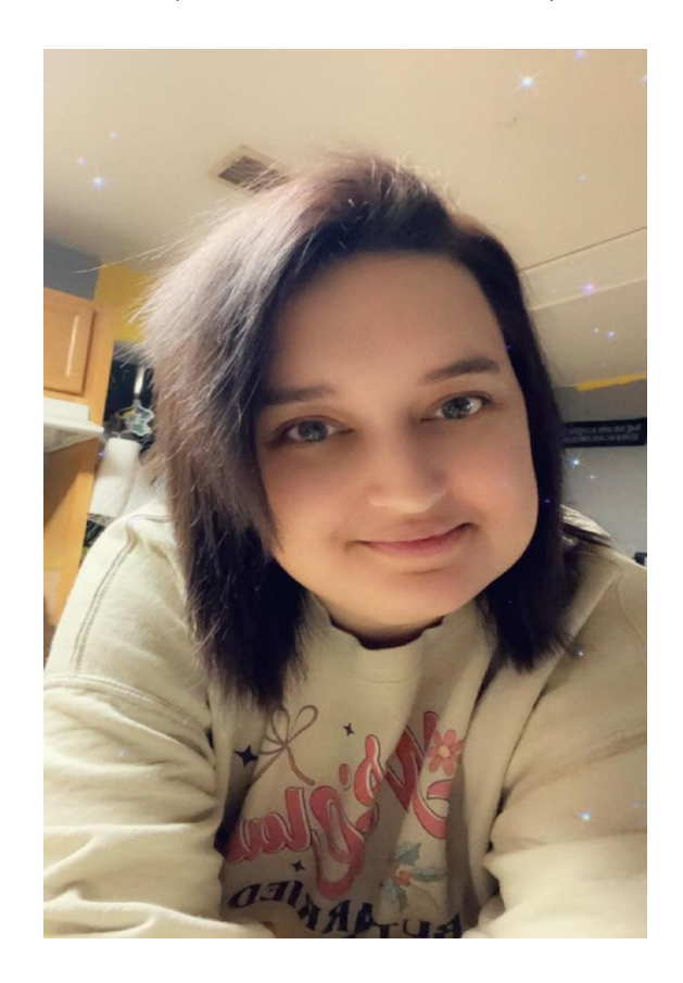
Graduating in Spring of 2024

Associate of Science, Liberal Arts and Sciences; Associate of Arts