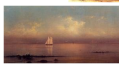
Dawn Thunder Storm On Narragansett Bay Becalmed Long Island Sound