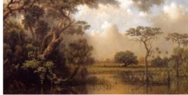
The Great Florida Marsh Sunny Day On The Marsh (Newburyport Meadows) Sunset Over the Marsh