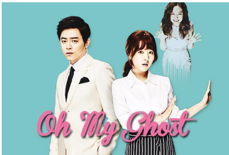
Cultural Anthropology 1019 Korean Drama

I believe that college is a wonderful place where we have the ability to safely house the exchange of ideas, and perspectives whether they be controversial or not, and that we have a place where we can ask questions. I believe that each of my honors classes have afforded me the opportunity to explore a variety of perspectives from that of the ancient Greek people stopping war with sex, from the Native Americans struggles in the early 1900's, to the cultures we are a part of in modern times through the analysis of sitcoms, k dramas, videos in class, and various textbooks.