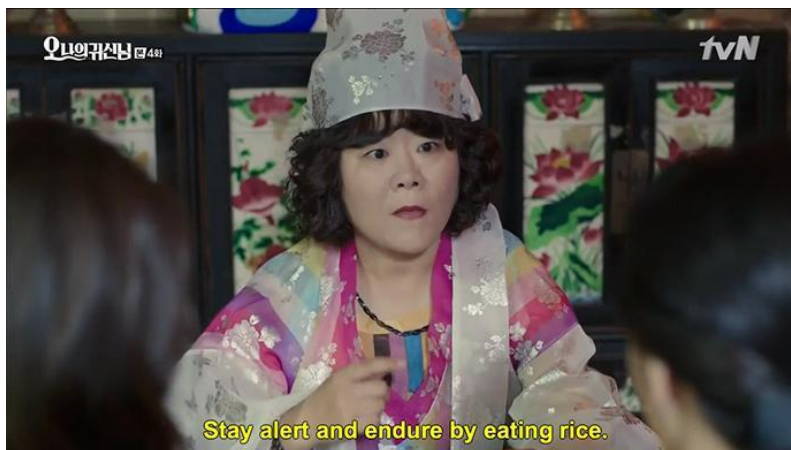
Korean Shaman Presentation Cultural Anthropology 2019