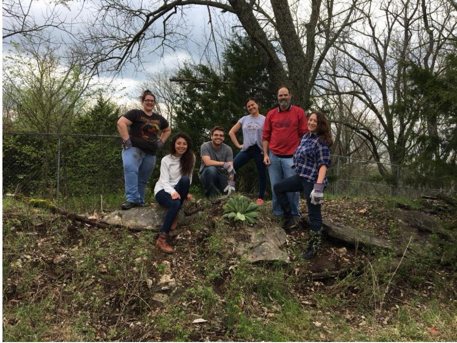
Service Learning 2018