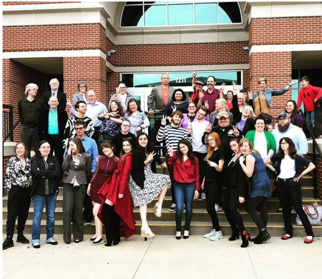
Honors Academic Awards 2018

Advice...well I would tell my fellow student before they started this wonderful journey that they should never be afraid to ask questions, and to ask for help. I encourage you to stimulate your mind, be willing to advise your preconceived notions of things such as history, and to always ALWAYS strive for what is right, what is true, and what sets your soul on fire.