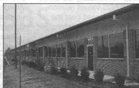
HarBer School of Nursing E. Emma Ave.