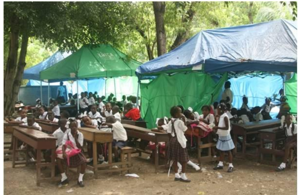
("Live from Leogane: Orphans International Partners with Haitian School Founded by Orphan.")