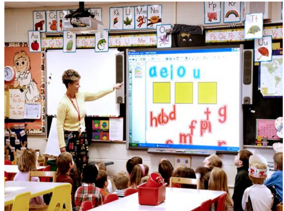
(“American Education History and Reform.”)