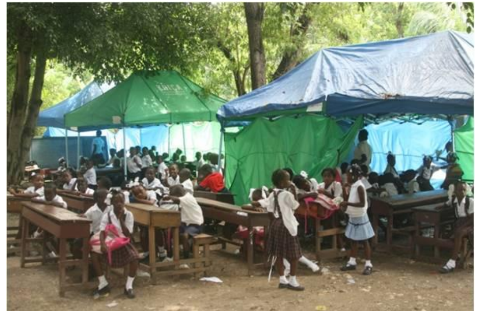
("Live from Leogane: Orphans International Partners with Haitian School Founded by Orphan.")