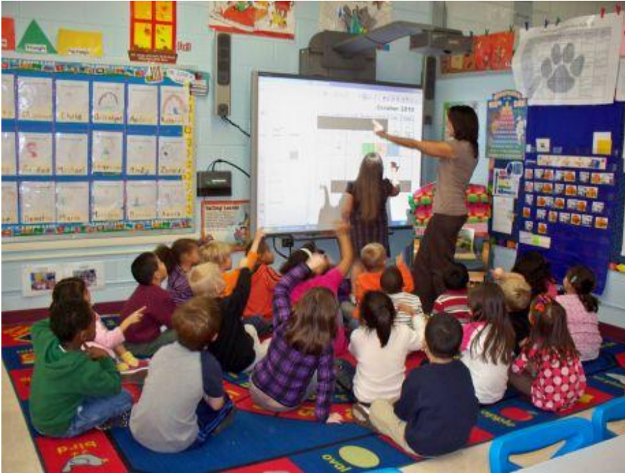
(“American Education History and Reform.”)