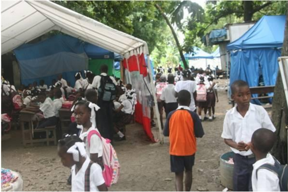
("Live from Leogane: Orphans International Partners with Haitian School Founded by Orphan.")