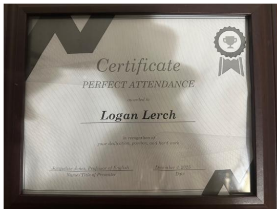
Figure 6 Perfect Attendance Award

One experience I had as a member that impacted