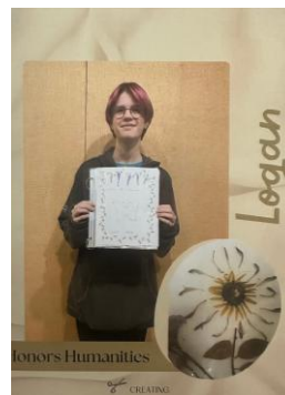
Figure 3 The Humanities Project I presented