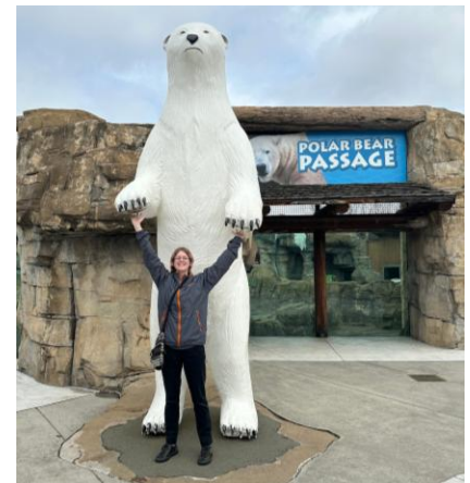
Figure 7 Me at the Kansas City Zoo in front of a polar bear statue

Some advice I would give to any new member of honors is to take a risk and be confident in your work. There are so many experiences to have in life, so much to create and discover. Continuous effort in doing what you're passionate about will produce wonderful things. Your energy, time, and ideas are worth listening to and developing into something great.