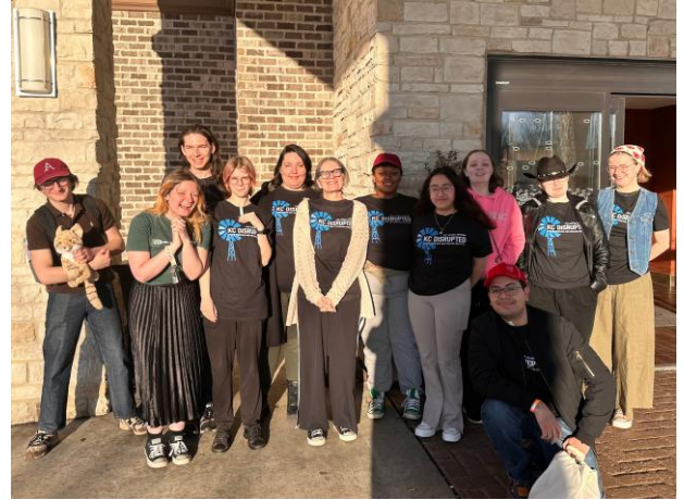
Figure 5 The wonderful people I went with to Kansas City

One experience I had as a member that impacted