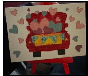
Figure 2 My painting for the Valentines Meeting

I also got to travel with the honors program to the Great Plains Honors Conference and presented work from my Exploring the Humanities course. Getting to engage with other honors students and explore their works, and research made me question things I knew nothing about, and I got to discover so many new areas of study.