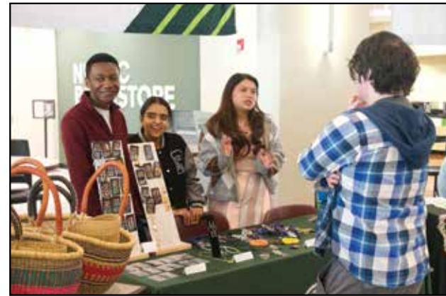
During international education week at NWACC, the college held an international market in the student center building. Many market booths were showcased, such as Canopy Northwest Arkansas.