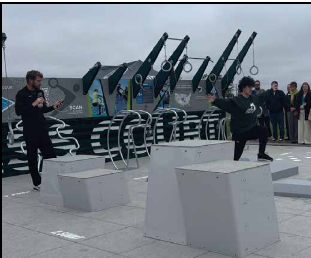
Athletic students demonstrate the fitness court to attendees.

The new NWACC Fitness Court is now open for public use and serves as a new space for health, community, and connection on campus.