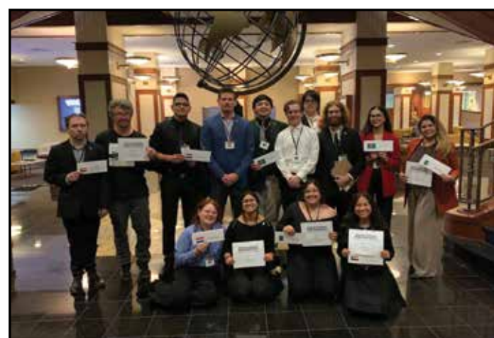
NWACC’s Model UN team posing for a photo at the Conference awards on Nov. 17.

Arkansas State University, Harding University, John Brown University, and the University of Central Arkansas also had students represented in the conference. Seventy-five students competed in the 15th annual Arkansas Model UN event.