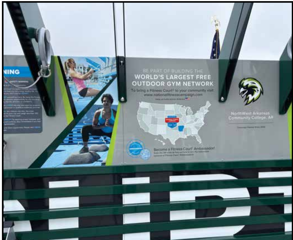
A sign placed on the fitness court stating, "WORLD'S LARGEST FREE OUTDOOR GYM NETWORK"