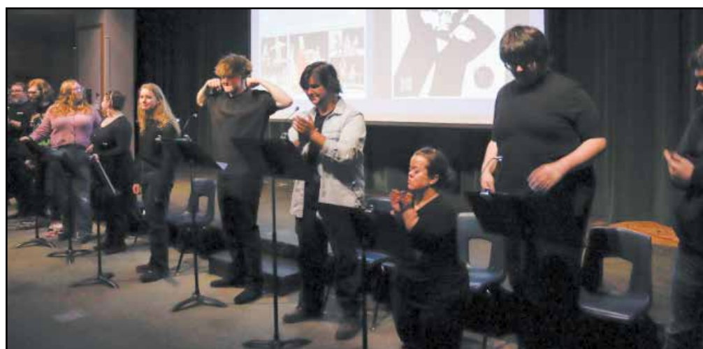
Theatre program students performing together.

With excitement already building for upcoming activities, like a showcase, playwriting, as a subject, continues to evolve as a place where creativity flourishes, confidence grows, and stories unfold one act at a time.