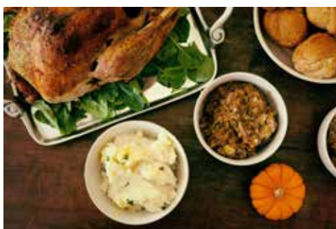
A traditional Thanksgiving meal may be central to some celebrations.

Luckily for me, I had some time and I thought about seeking a second opinion, a second pair of eyes. I had signed up for spring classes recently and I thought I had my schedule mapped out for the most part. So, I went and met with an academic adviser to more or less confirm whether I was on the right track. The adviser let me know that I was extremely close to getting an associate's degree. That is, if I tweak my schedule a bit. I took the recommendation and switched out one of my classes for another one that I had not thought about, and by next semester I should have an associate's degree. But the thing is, this scenario would not have been possible had I not met with that adviser. So, I have to be thankful