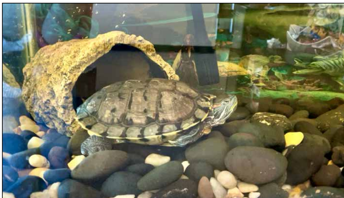
Frankie is a turtle who can be seen at NWACC's Counseling & Wellness Center

For students who need more specialized care—such as a formal diagnosis or medication—the center provides preliminary evaluations and connects students with community resources based on insurance and individual needs. The goal is to establish a coordinated care team where everyone works together to support the student.