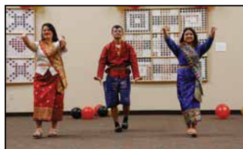
Multicultural performances from the community coordinated by the Global Affairs Council.

As the gathering wrapped up, coordinators urged students to maintain connections and keep an eye out for upcoming Global Affairs happenings, each one designed to bring people together, celebrate culture, and strengthen the welcoming community that NWACC is known for.