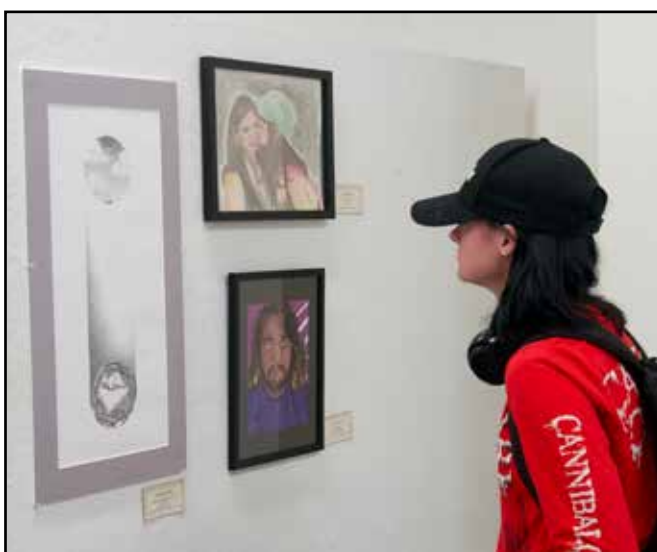
A guest at the student works exhibition opening reception studies some of the artwork.