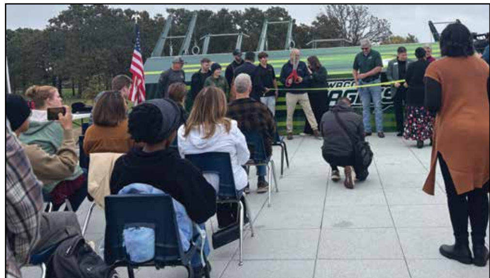
College officials and representatives from local chambers and Flintco cut the fitness court ribbon on Oct. 27.