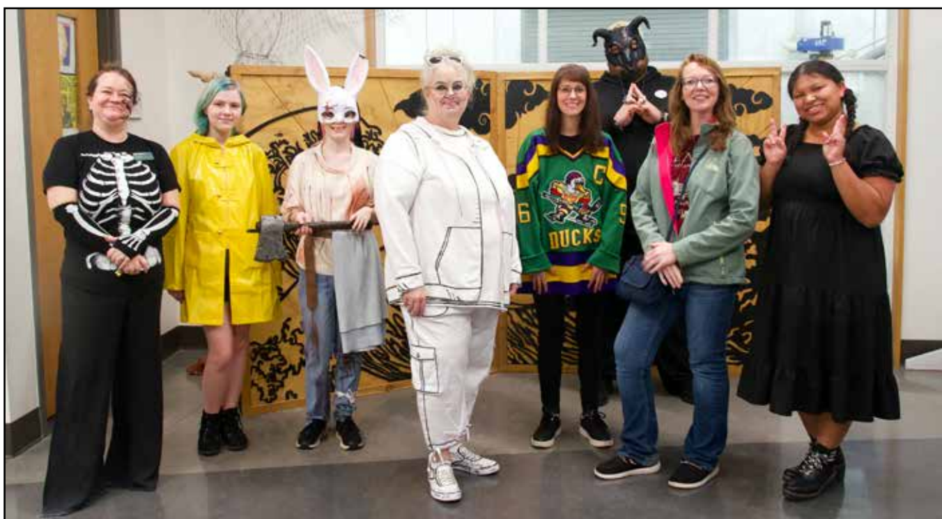
Art Club members and attendees pose for a group photo at the Spooky Opening Reception. Below, guests look at the submissions.