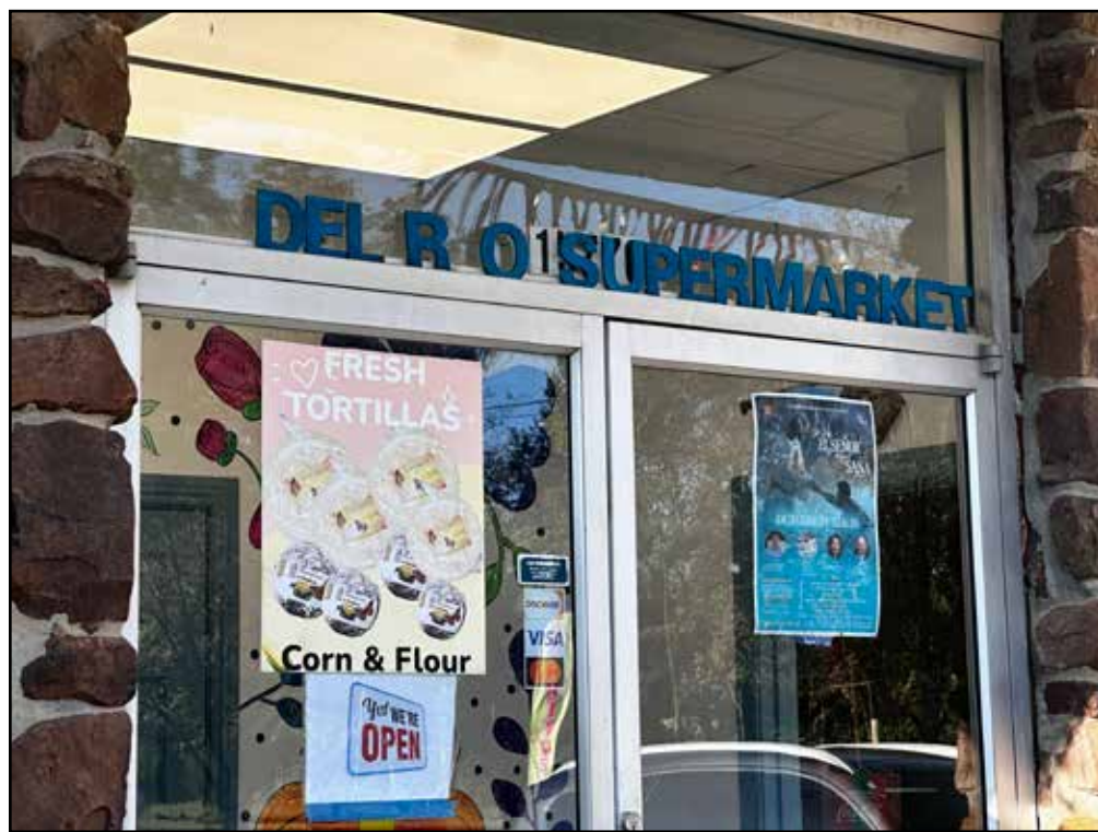
Front doors of Del Rio Supermarket

So why the ICE actions? According to a report by the Wall Street Journal (Online) on June 10, "Agents didn't need to develop target lists of immigrants suspected of being in the U.S. illegally, a longstanding practice, Miller said. Instead, he directed them to target Home Depot, where day laborers typically gather for hire, or 7-Eleven convenience stores."