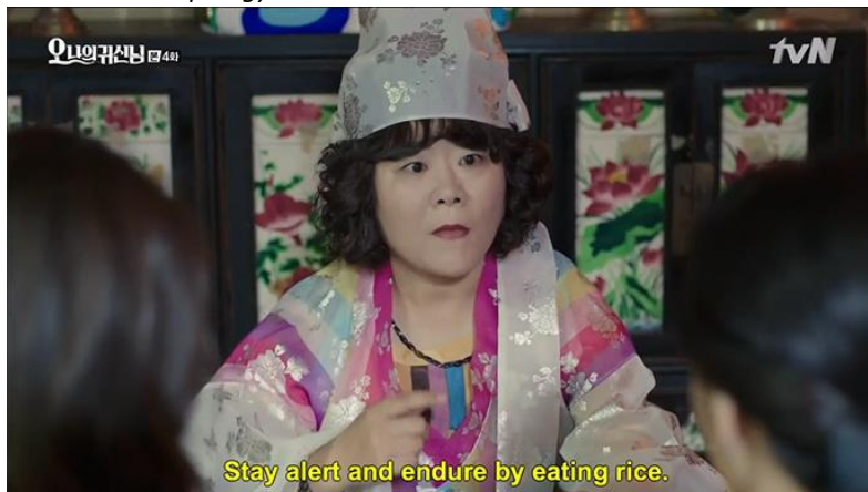
Korean Shaman Presentation Cultural Anthropology 2019