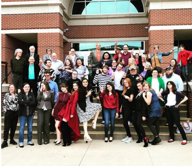
Honors Academic Awards 2018

Advice...well I would tell my fellow student before they started this wonderful journey that they should never be afraid to ask questions, and to ask for help. I encourage you to stimulate your mind, be willing to advise your preconceived notions of things such as history, and to always ALWAYS strive for what is right, what is true, and what sets your soul on fire.