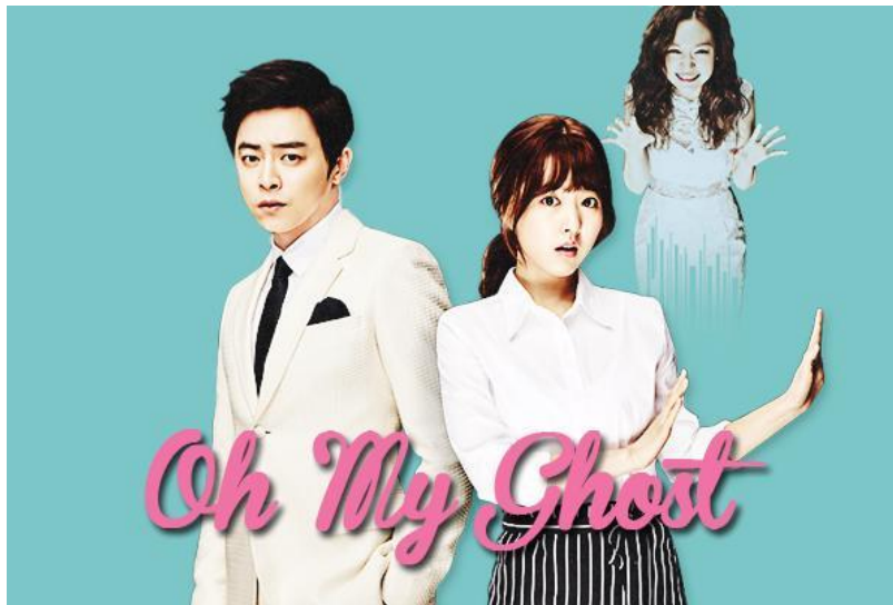
Cultural Anthropology 1019 Korean Drama

I believe that college is a wonderful place where we have the ability to safely house the exchange of ideas, and perspectives whether they be controversial or not, and that we have a place where we can ask questions. I believe that each of my honors classes have afforded me the opportunity to explore a variety of perspectives from that of the ancient Greek people stopping war with sex, from the Native Americans struggles in the early 1900's, to the cultures we are a part of in modern times through the analysis of sitcoms, k dramas, videos in class, and various textbooks.